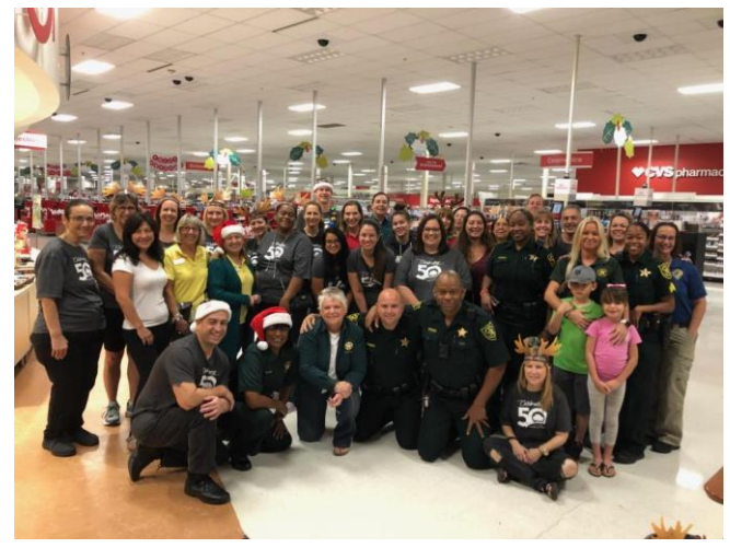
Special friendships are made at our club